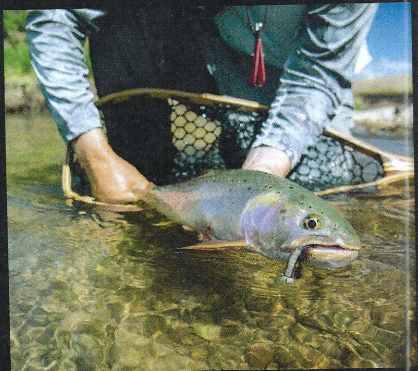
Like all the other subspecies, Bear River cutthroat trout love dry flies—even patterns that imitate mice.