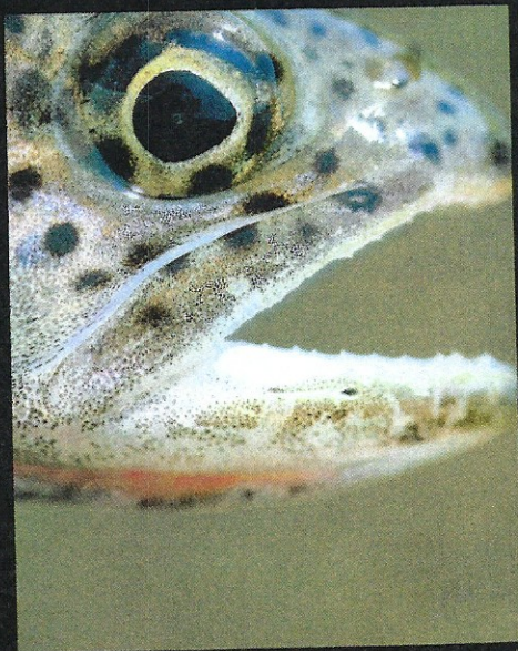
The signature bright-orange slash glows on a Lahontan cutthroat caught and released in the Tahoe Basin of California.